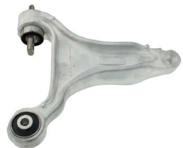
XC70 MEYLE no. 616 010 0005/HD [Short no. MBJ0271HD]