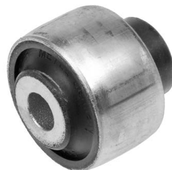
MEYLE no. 514 610 0005/HD [Short no. MCB0283HD]