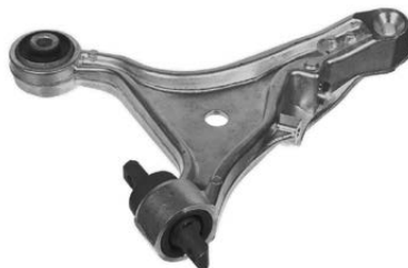
S60 + V70 II MEYLE no. 516 050 0017/HD [Short no. MCA0665HD] 516 050 0018/HD [Short no. MCA0666HD]