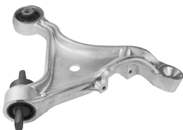
S80 MEYLE no. 516 050 0007/HD [Short no. MCA0657HD] 516 050 0008/HD [Short no. MCA0658HD]